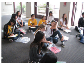
Middle School Leadership Conference

To subscribed to the TUSD Online Newsletter, go to http://www.tUSD.org