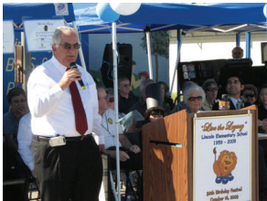
Lincoln Elementary's 60th Anniversary